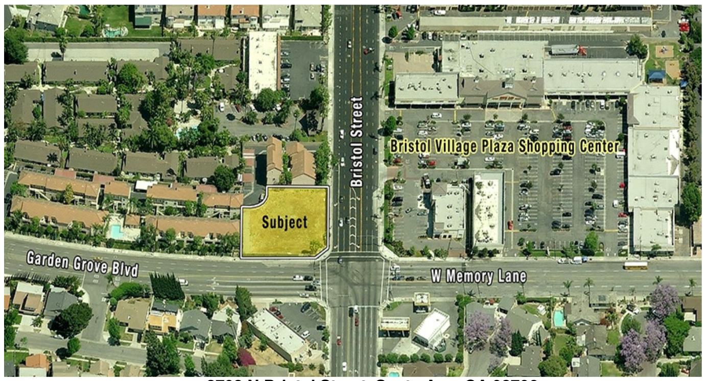
2702 N Bristol Street, Santa Ana, CA 92706