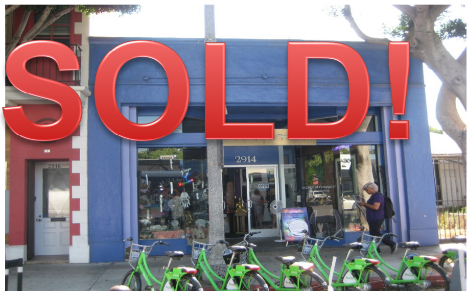
2914 Main Street, Santa Monica, CA 90405