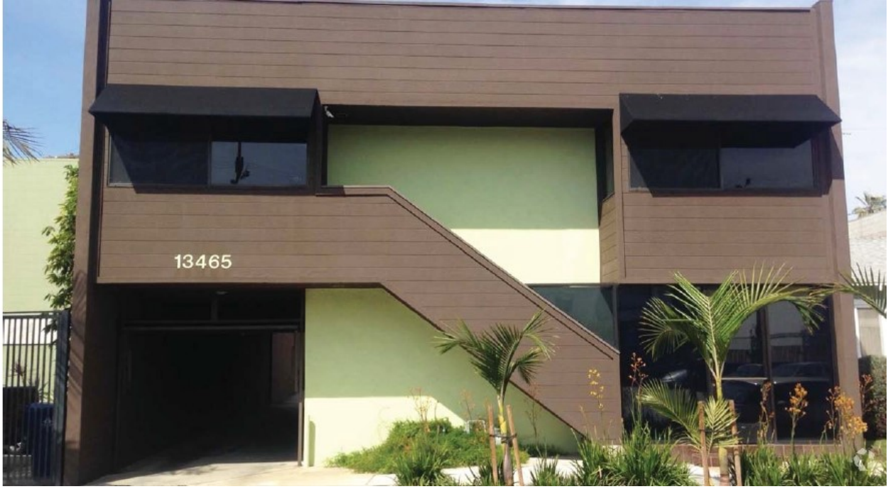
Approximately 1,300 sq ft ground floor office space - Available Now!

Address: 13465 Beach Ave, Unit A, Marina Del Rey, CA 90292