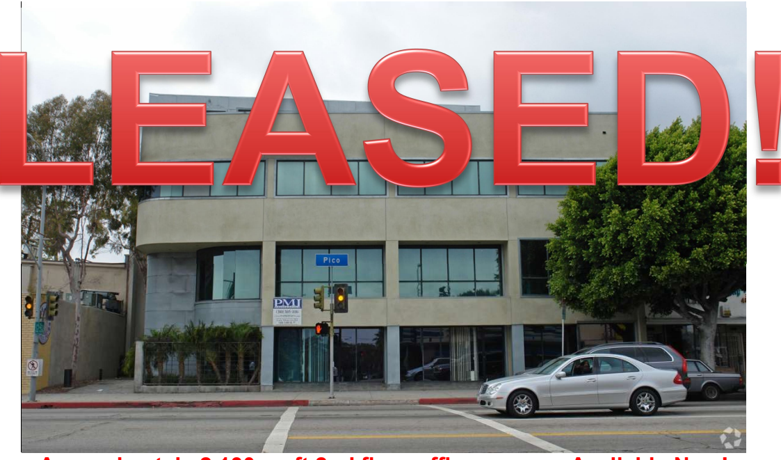
Approximately 2,130 sq ft 2nd floor office space – Available Now!

10951 W Pico Blvd, Unit 204, Los Angeles, CA 90064 Address: