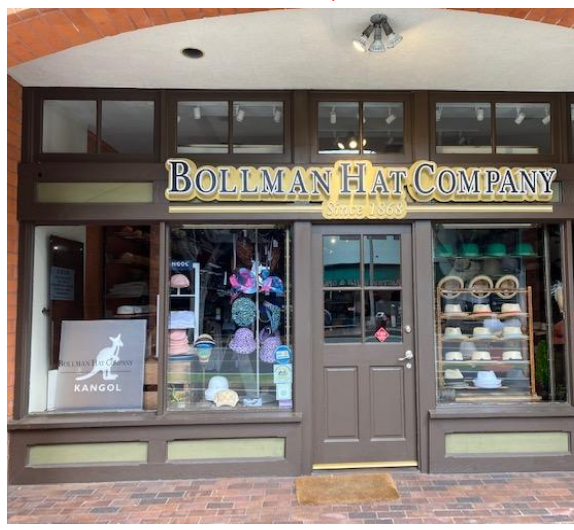
Suite C - 780 SF