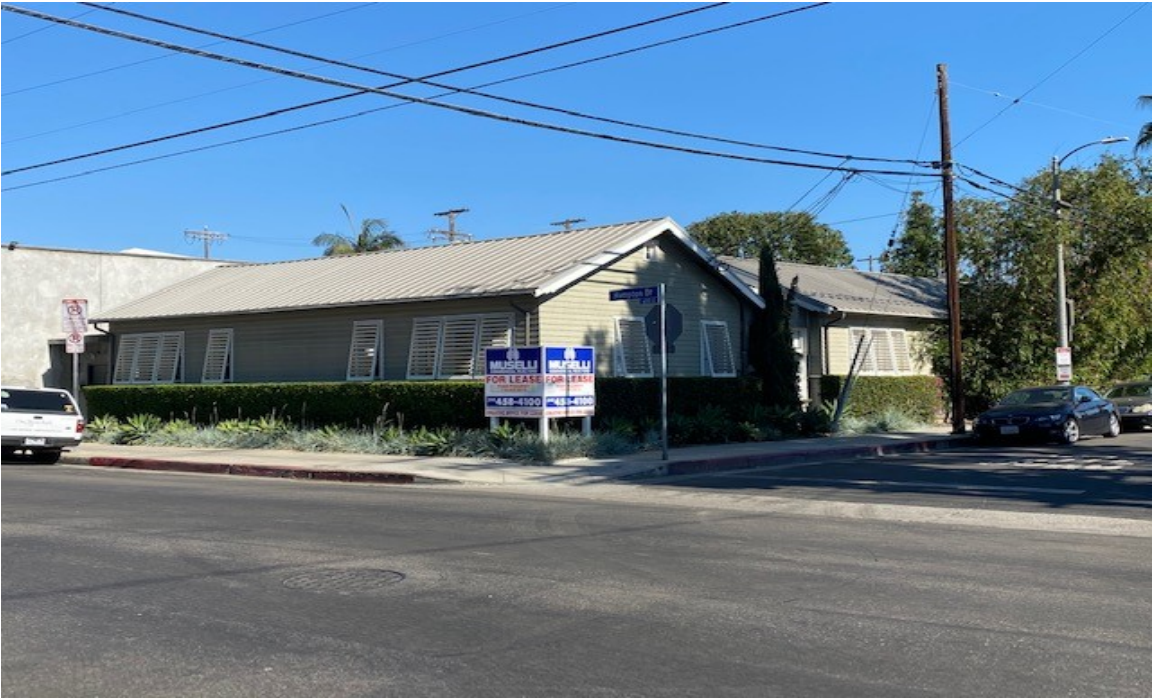
Approximately 1,364 – 3,532 SF Creative Office for Lease

Address: 618 - 624 Hampton Drive, Venice, CA 90291