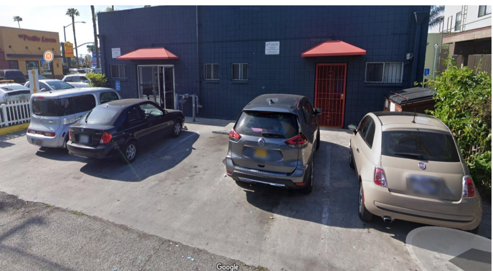
6 Parking Spaces in the Rear of the property