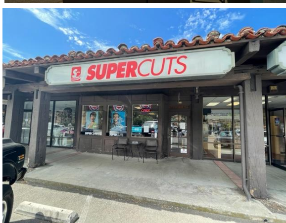
Prior Tenant - Supercuts