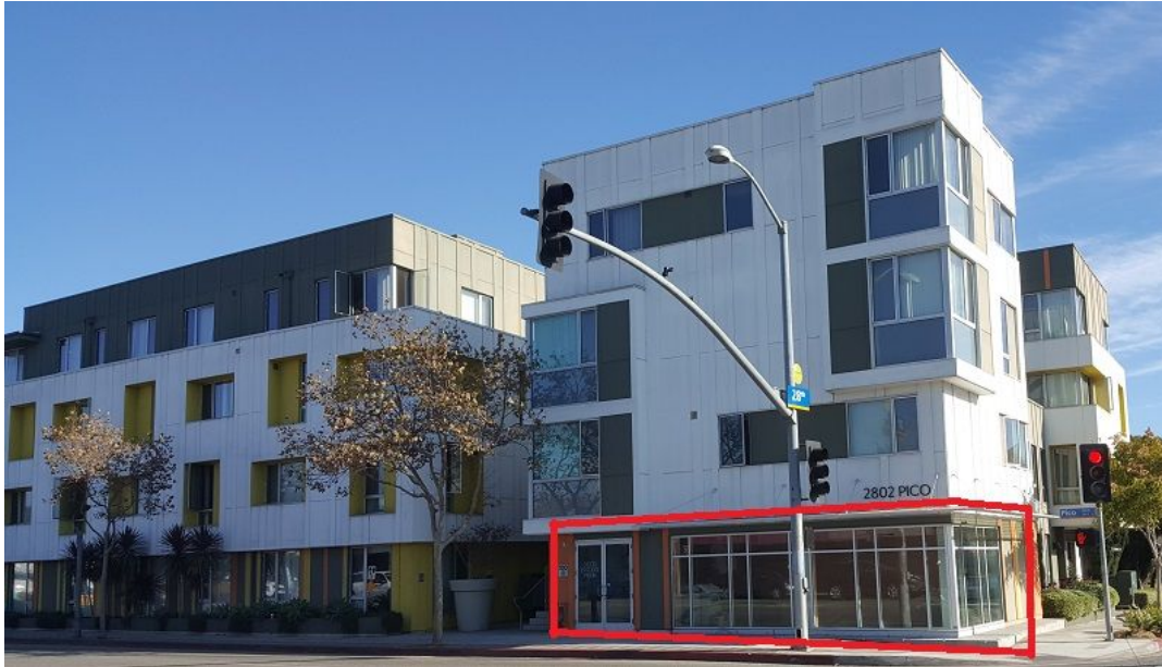
2802 Pico Boulevard, Santa Monica, CA 90405