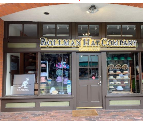
Suite B 900 SF