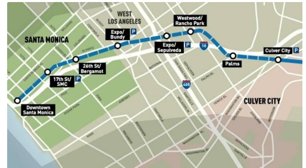
Metro Expo Line