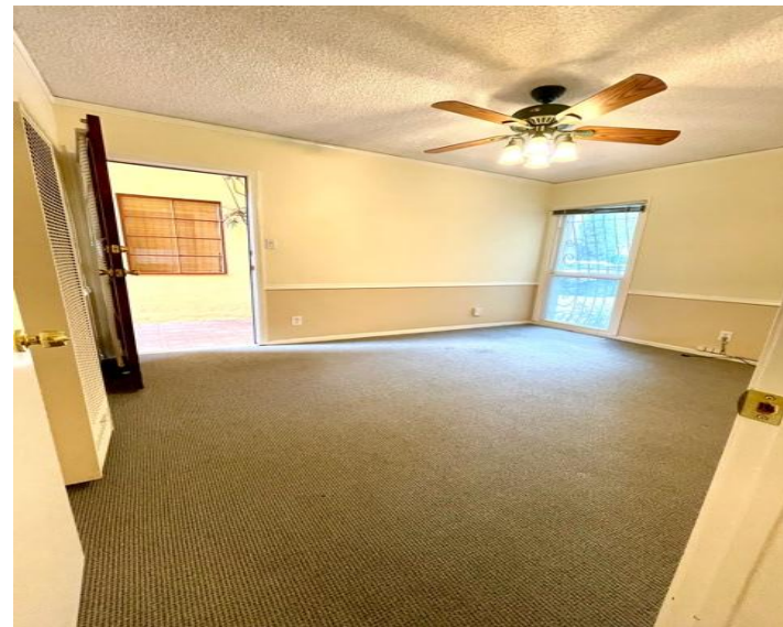
Suite 102 A