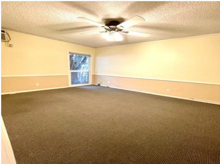
Suite 102 A